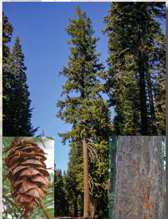
Pseudotsuga menziesii - Douglas fir