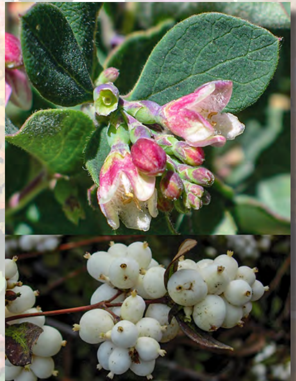
Symphoricarpos albus - snowberry