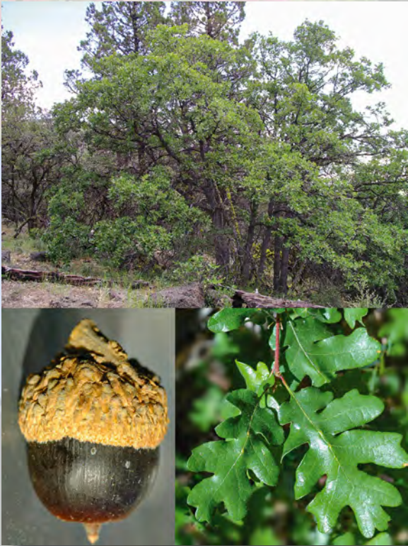
Quercus garryana - white oak