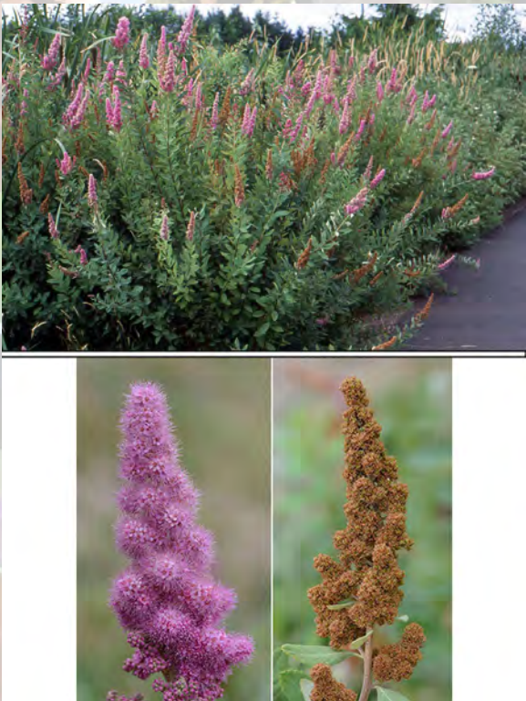
Spirea douglasii - Douglas' spirea