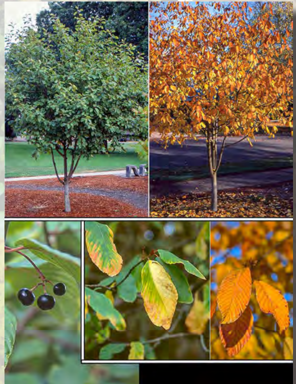
Frangula purshiana - cascara / bearberry