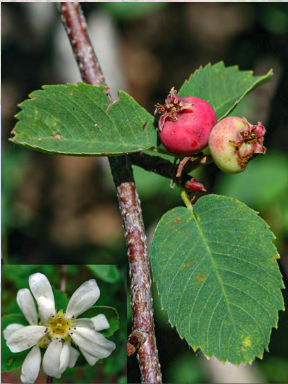
Amelanchier alnifolia - serviceberry