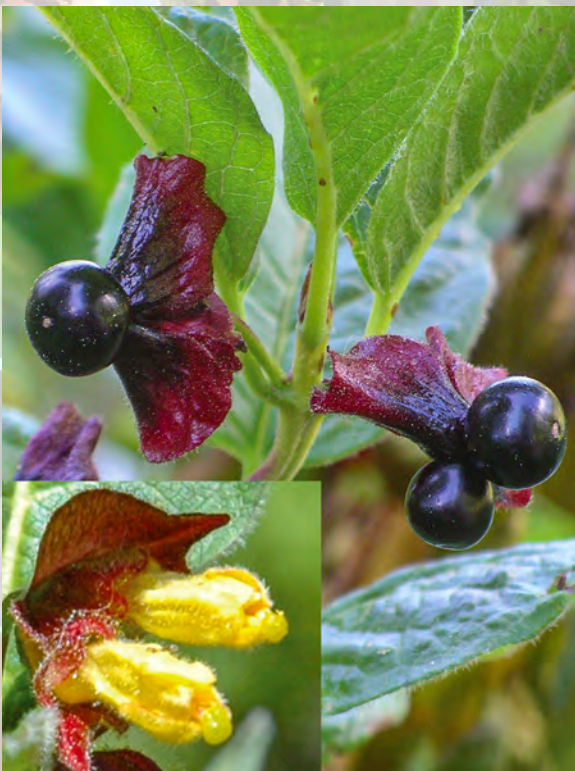
Lonicera involucrata - twinberry honeysuckle