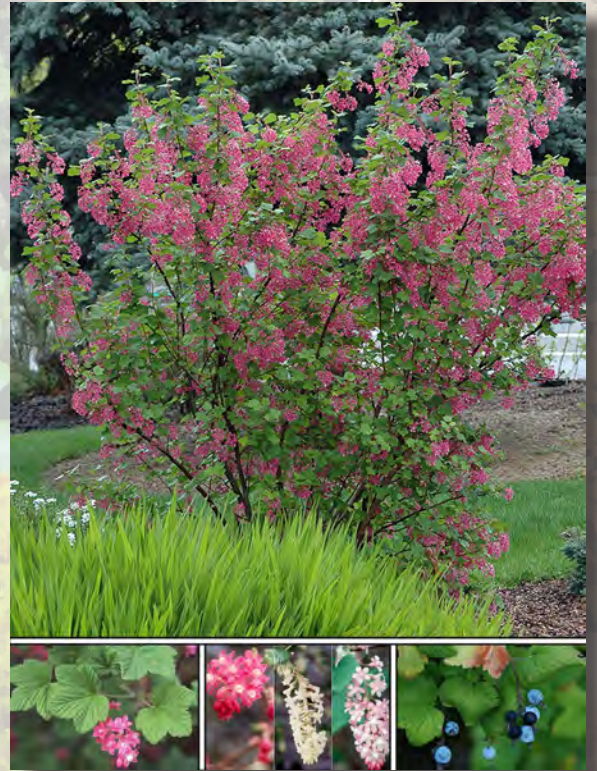
Ribes sanguineum - red currant