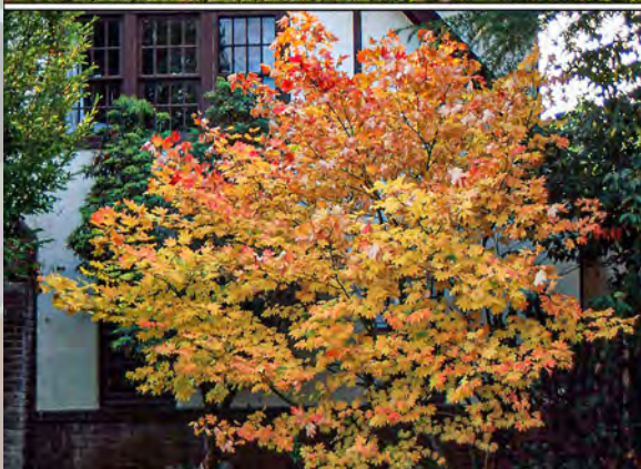
Acer circinatum - vine maple